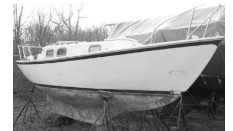
1969 24' 7" Bristol Corsair

1969 24' 7" Bristol Corsair (URIF# S-0210914) $2000. Beam: 8' - Draft: 3'5" - Displ: 5920 lbs. (Picture at top of next column.)