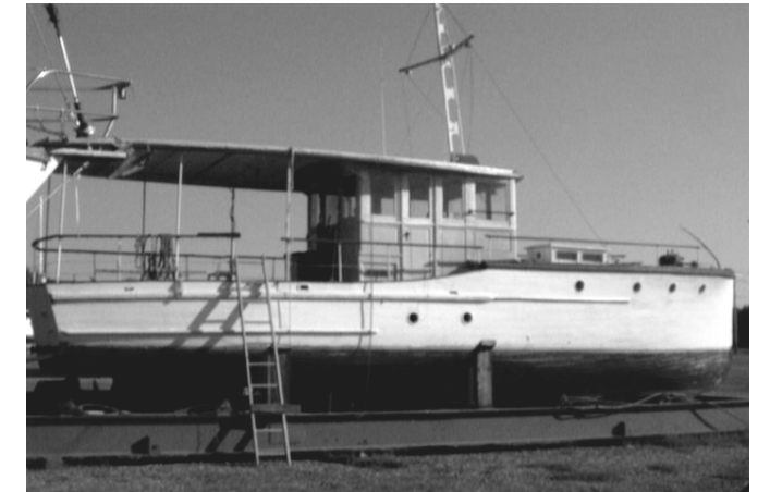
1927 ELCO Flat Top 42'

NEEDS RESCUE: ELCO, Flat Top, 1927, 42'. TEDDYBOLD (hull no. 2383) has had one owner since 1964, SCRIMSHAW prior to that. Very original except aft trunk cabin was removed half a century ago, leaving a huge covered deck with huge storage below. She has been afloat and operational continuously until August 1, 2005. Ford six cylinder diesel in good running condition. All critical repairs to a small stem area are complete and she is now able to launch or be trucked anywhere. Has all the frame, floor timber, butt block, and keel issues of any other boat over sixty years old, but repairs have been made continuously so she is still reasonably seaworthy. Owner is looking for someone who would promise to maintain and use her and cover the outstanding yard bill. Contact John, a friend of the owner, who knows both TEDDYBOLD and ELCOs well, at JLEaton@Friend.ly.net or 410.604.3550, or Chip, owner's son at charliet@netreach.net Located Rock Hall, Eastern Shore of Maryland. (MD) [H101]