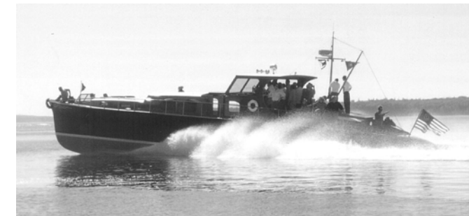
APHRODITE – Oct 3, 2005