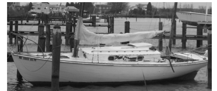
1948 HERRESHOFF -- H-28 KETCH -- 28'

"It's now time for someone to come along and give this boat a good home." FREE! See details on page 3.