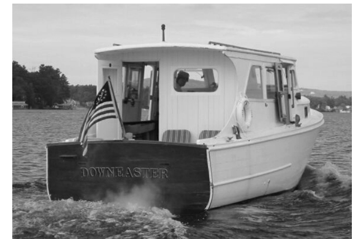
1948 MORSE CRUISER 32'

MORSE Cruiser, 1948, 32'. Downeaster, cedar & oak wood cruiser, designed & built buy WJ Morse of Thomaston, ME. Powered by a rebuilt 6 Cyl Palmer (International Havester) 135 HP gas motor. This 32' Downeaster has had only 3 owners! ...details on Page 10.