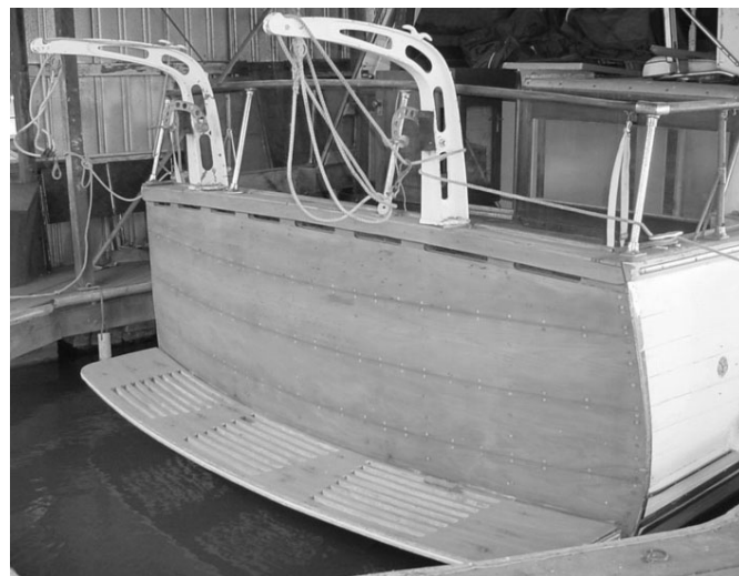
Details on Page 5.

Know someone who would enjoy a Bone Yard Boats subscription? Great gift idea!