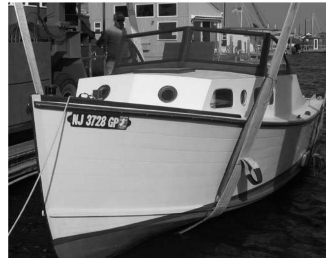
1952 CROSBY STRIPER HULL #20

When I first saw a Crosby Striper at an ACBS show in Bay Head N.J. in 1998, I told my wife that was the kind of wood boat I wanted to restore next. I have had some experience restoring and working on wooden boats over the past 30 years and was ready to take on another challenge. However, the Crosby I saw for sale was at a price beyond my means, but I decided right there that I would go out and find one that needed to be "saved." I looked for the next 2 years and finally came across Hull # 20 in Sodus Bay N.Y.