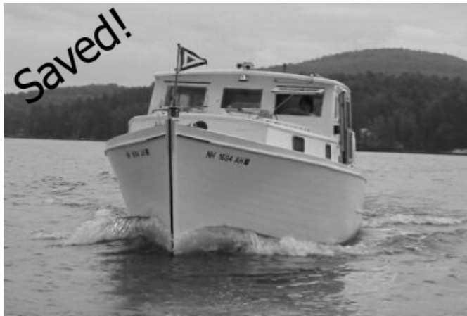
1948 MORSE CRUISER 32'