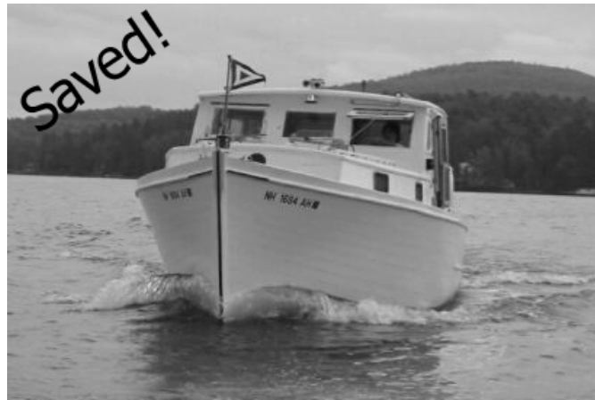
1948 MORSE CRUISER 32'