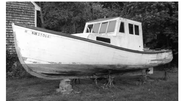
1940 JONESPORT LOBSTER BOAT

1940 JONESPORT LOBSTER BOAT. Owner says, "She was in the water 3 years ago as a working lobster boat off the coast of NH. Engine crank turns over but doesn't run, I've been told by mechanics that it could be rebuilt... available to a good home." Asking: FREE! Contact: 978-465-4353 or wetenkamp@comcast.net