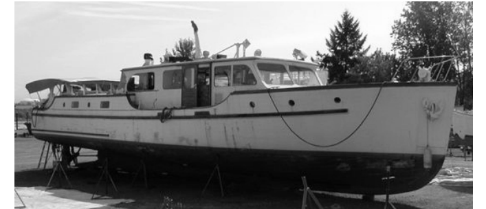
1941 EDWIN MONK DESIGN 63' – TAKING OFFERS!!!