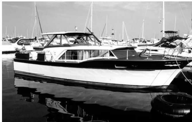
1960 CHRIS CRAFT CONSTELLATION 36'