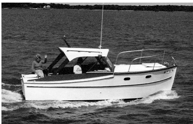
1960 CUSTOM CRUISER 20'