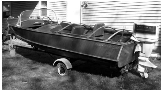
1955 WHIRLWIND DELUXE 17'

1955 WHIRLWIND DELUXE 17' . Mahogany hull & deck. 35hp 1986 Force outboard. Owner says, "Nice runabout. 6 years under cover outdoors. Needs refinishing to look best but all sound wood. Motor has low time. Trailer needs tires otherwise boat, motor & trailer all in good condition. She always received praises at the local launch. Looking to sell to someone who appreciates wood boats, a dying breed." (Ain't that the truth! -- sorry, publisher commentary!) Asking: $3000 ("neg"). Scotia, NY. Contact Tom at alit-62825@mypacks.net