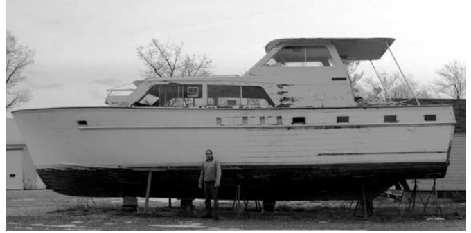
FREE -- 1966 MATTHEWS FLUSH DECK 45' -- FREE

1966 MATTHEWS FLUSH DECK 45'. This restorable yacht is being offered for FREE . This boat deserves to be restored and FREE is a good start. Give Jed a call! Details on front.