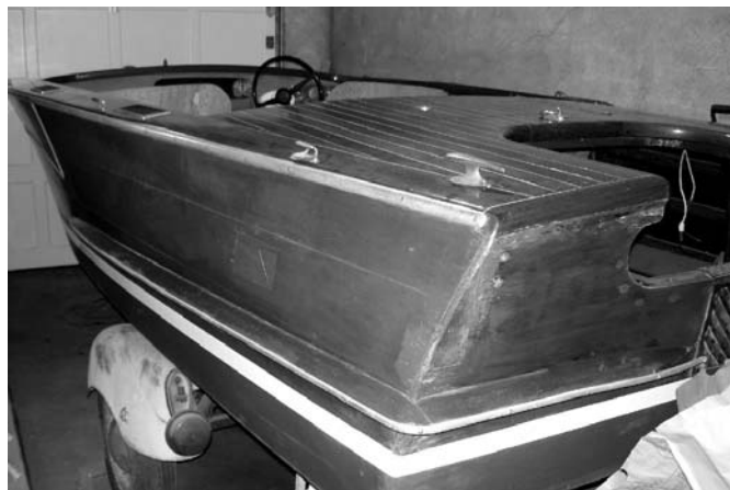
1956 SHEPHERD OUTBOARD 15'