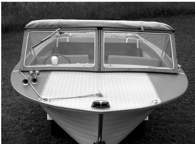
1964 CRUISERS INC. SUPER VACATIONER 20'

1964 CRUISERS INC. SUPER VACATIONER 20'. Fir plywood over oak hull. 1966 Evinrude outboard 100hp. Owner says, "Classic,mint condition,100% original. This was the last year Cruisers,Inc. built a wood lapstrake boat. Basically the last Thompson wood boat made..." Asking: $7,500. Contact Jim at jaekels@ez-net.com or 920-834-5500 (WI)