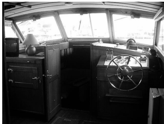
1967 EGG HARBOR GOLDEN EGG 37' -- HELM

1967 EGG HARBOR 37'. Golden Egg Model. Wooden classic. Twin 318 Chrysler, gas, air, newer canvas, sleeps 5, well maintained. Asking $8,000 / OBO. Contact (610) 964-9246 or email 224mac@msn.com (NJ)