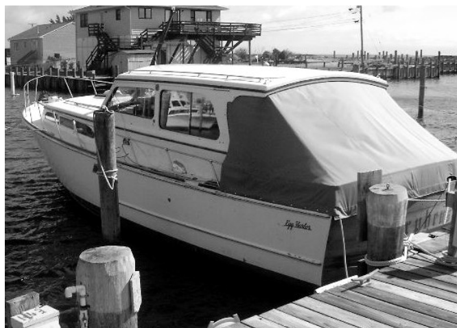
1967 EGG HARBOR GOLDEN EGG 37'

1967 EGG HARBOR 37'. Golden Egg Model. Wooden classic. Twin 318 Chrysler, gas, air, newer canvas, sleeps 5, well maintained. Asking $8,000 / OBO. Contact (610) 964-9246 or email 224mac@msn.com (NJ)