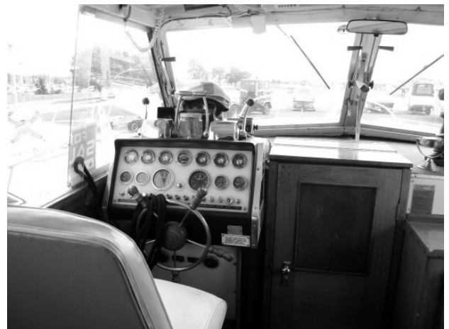
1969 CHRIS CRAFT CONSTELLATION 31' - HELM

1969 CHRIS CRAFT CONSTELLATION 31'. According to Jim: "This is a 4 Seas model, 31'X 11'4" beam with lapstrake construction. She is powered by twin 327 Thermocons that have no more than 280 hours since re-build. This boat has been well kept and is very clean inside and out. She can be launched where she is and used this season! Owner must sell. All documentations, recent survey and a new topper included. Make an offer." Contact Jim at Innerbay Boats Ltd at (519) 875-3338 or jfhammond@kwic.com Langton, ON, Canada