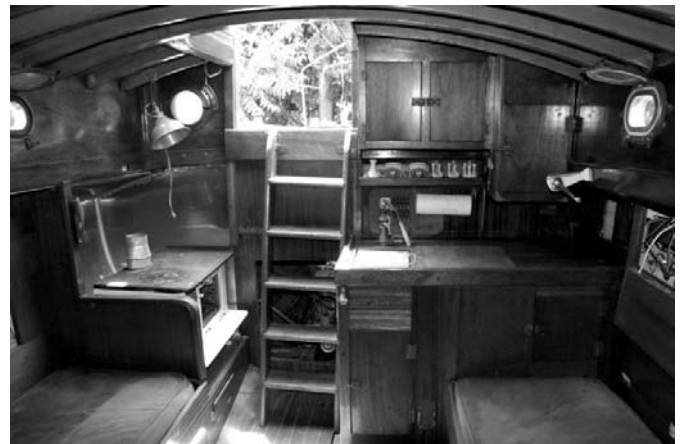
1939 JOHN ALDEN CUTTER 41' - PRIMROSE INTERIOR