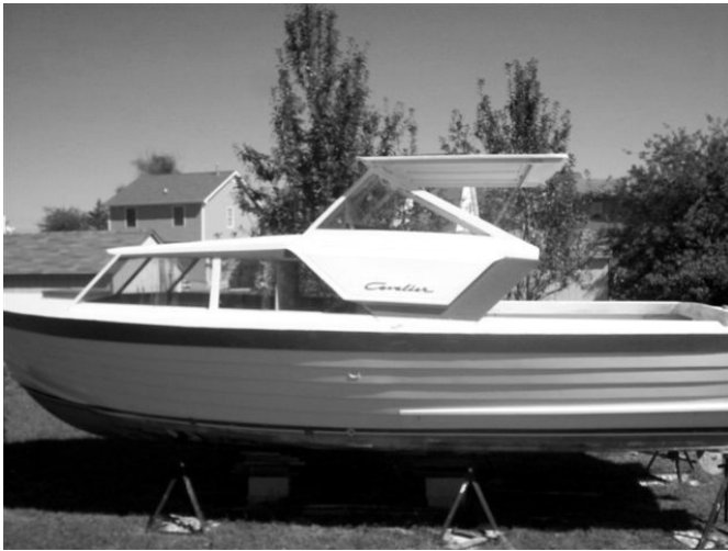
1966 CHRIS CRAFT CAVALIER 27'