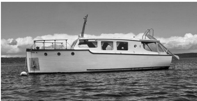
1939 ED MONK 37'

1939 ED MONK 37'. Owner says, "The boat is 36 feet long and has a 350 Merc Cruiser engine. The engine only has about 1700 hours on it. The boat was hauled out of the water and inspected two years ago. I repainted it again about a month ago (April/May '08). There is a water slide mounted on the back of the boat. I also have all the original paperwork for the QUIET HARBOR. The QUIET HARBOR is currently moored in Olympia, WA." Asking $10,000. Contact Ryan at (360) 480-0514 or email: Lnkjames3@msn.com (WA)