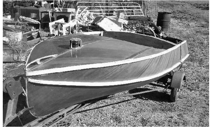
1953 WHIRLWIND DUAL COCKPIT 14'

little boat and looks like a fairly easy restoration." Asking $5000 – Negotiable. Located just outside of St. Louis, MO. Contact Robert at robert.bilderback@emerson.com