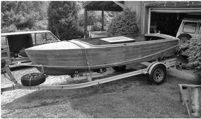
1952 CHRIS CRAFT DELUXE UTILITY

1952 CHRIS CRAFT DELUXE UTILITY. Owner says, "This is Chris Craft #3564 Deluxe Utility and excellent restoration opportunity. The boat was allowed to weather enough that it needs decks but the sides and bottom look great. The frames are sound, seams are tight and the inner plywood is good. The underside needs sanding and paint. The overall lines are great. It's a fine looking boat and all the planks on the sides appear good. The inside is clean and rot free; the engine is disassembled. The dash has a crack by the glove box, but all the chrome is good and the boat is on an excellent trailer." Asking $3,850 or best offer. Contact Howard at 301-627-2114 or email: oldtimeworld@aol.com Upper Marlboro, MD 20772