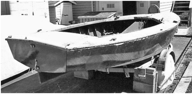
LIPPINCOTT LIGHTNING 19'

LIPPINCOTT LIGHTNING 19'. Hull #8516. Beam 6'6". White cedar hull. Owner says, "Boat was neglected for some time before I took her over for rebuilding, but time and money are just not available now. Needs rebuild: a bottom plank, deck, all mouldings, tiller, and cockpit flooring. Has: main, jib, spinnaker, rudder, centerboard, cockpit tent awning, wooden spars, new mast with cover, most hardware, EZ Loader trailer with new wheels and tires." Asking: $900. Contact Joost at joostyff@verizon.net or 410-956-9352. (MD)