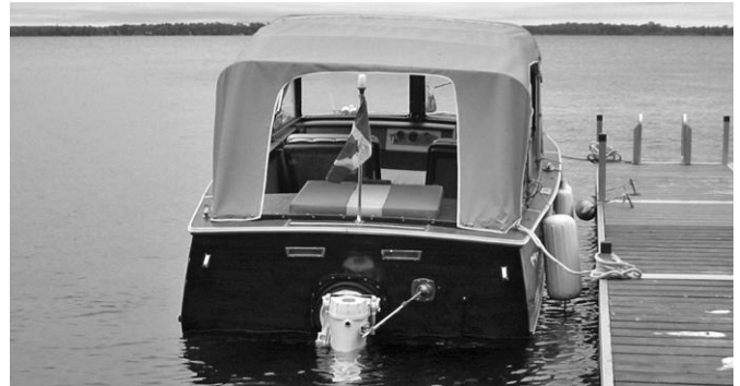
1962 GREW CRUISER 20'