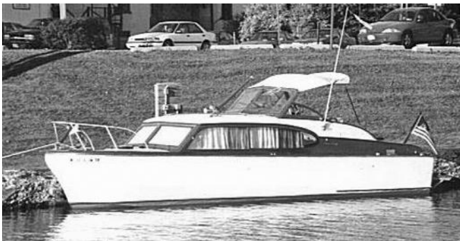
1956 CHRIS CRAFT SEDAN 28' -- WILD OATS

1956 CHRIS CRAFT SEDAN 28'. Mahogany double-planked hull. Owner says, "While I would not consider WILD OATS quite "bone yard" yet, as with any boat her age a little TLC wouldn't hurt. I would love her to go to a good home."