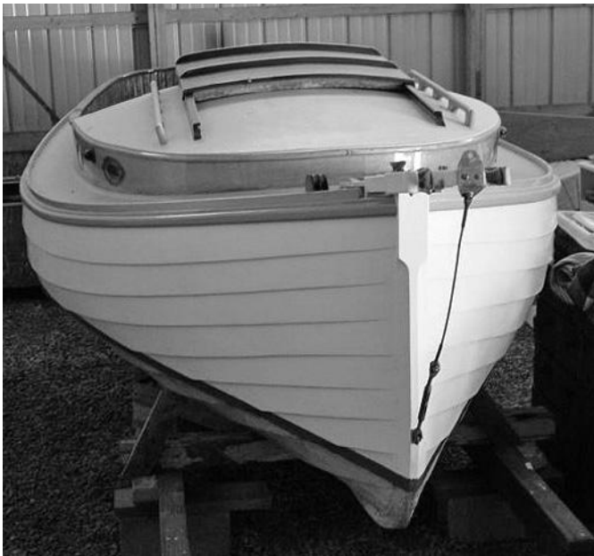
1980 JOHN D. LITTLE CATBOAT 16'

1980 JOHN D. LITTLE CATBOAT 16'. Owner says, "Built by John D. Little at Mill Creek Boat Shop in Maine. Lapstrake construction in good condition. Small cuddy cabin with bunks and cushions. Centerboard. Gaff rigged with a very recent sail, spars are in good shape. Cradle, spars, sail, oar, swim ladder and cushions included (there is no trailer). This would be a great boat for gunkholing in shoaly waters. It is small and manageable, but can accommodate for an overnight excursion. The hull is in good shape, but the brightwork will want some cosmetic attention. It is currently in indoor storage in Cataumet, and may be seen most anytime during the week by appointment." Asking $9000. Contact Amy at 508-563-2800 or Amy_bbs@cape.com (MA)