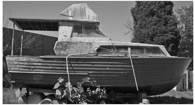
1968 OWENS 28'

1980 JOHN D. LITTLE CATBOAT 16'. Owner says, "Built by John D. Little at Mill Creek Boat Shop in Maine. Lapstrake construction in good condition. Small cuddy cabin with bunks and cushions. Centerboard. Gaff rigged with a very recent sail, spars are in good shape. Cradle, spars, sail, oar, swim ladder and cushions included (there is no trailer). This would be a great boat for gunkholing in shoaly waters. It is small and manageable, but can accommodate for an overnight excursion. The hull is in good shape, but the brightwork will want some cosmetic attention. It is currently in indoor storage in Cataumet, and may be seen most anytime during the week by appointment." Asking $9000. Contact Amy at 508-563-2800 or Amy_bbs@cape.com (MA)