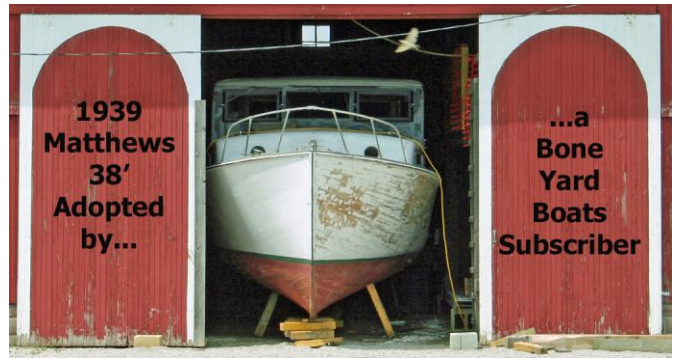
1939 MATTHEWS 38' STOCK CRUISER – FALL '07 ISSUE