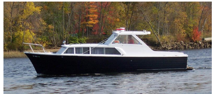
1962 CHRIS CRAFT SEA SKIFF 32'

1962 CHRIS CRAFT SEA SKIFF 32' . Custom hard top cruiser. Hull # ssc0050. Owner says, "C. MARIE ... is in great shape and fairly well equipped. Being the custom model she has a fabric headliner covering the ceiling beams and diamond embossed paneling covering the oak ribs. V berth and convertible couch are original white fabric.