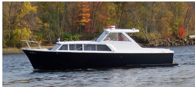
1962 CHRIS CRAFT SEA SKIFF 32'