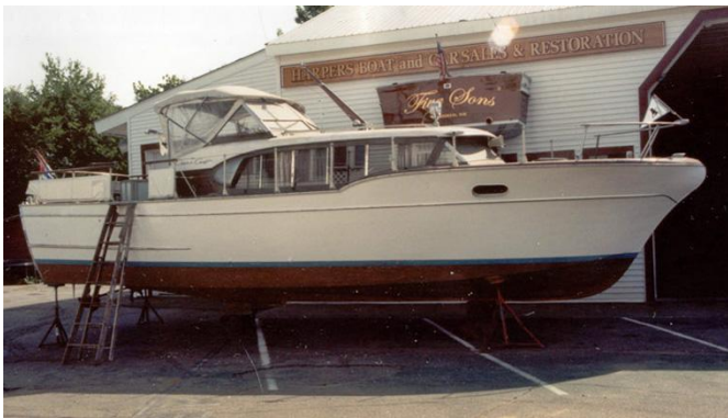
1959 CHRIS CRAFT CONSTELLATION 36'

1959 CHRIS CRAFT CONSTELLATION 36' . Twin 6 cylinders. Needs total restoration. Asking $10,000. Owner offers a layaway plan with minimal deposit, no storage fees, and no interest. Contact Jerry at (603) 279-8841 or email harperboats@gmail.com (NH)