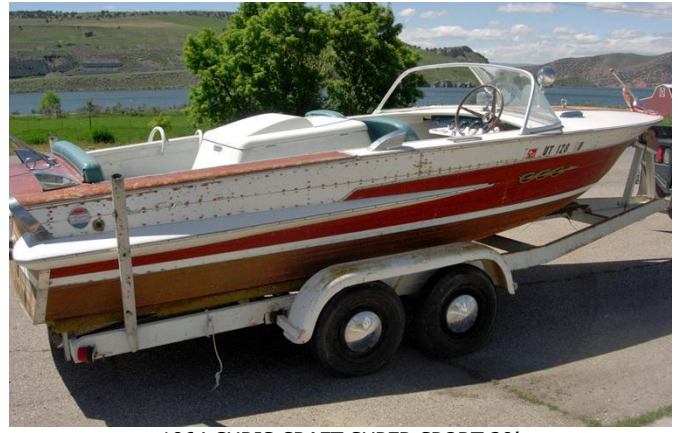
1964 CHRIS CRAFT SUPER SPORT 20'

1964 CHRIS CRAFT SUPER SPORT 20'. Owner says, "It is a 1964 Chris Craft Super Sport 20' with an inboard 327 Chevy (gas) engine with only 169 hours on it! It has always been stored in a garage and has only been used on fresh water lakes. The left side of the windshield is broke. Comes with trailer. Contact John at 435-640-5881 or email jadkins02ss@yahoo.com ( UT )