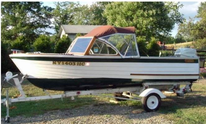
1962 CRUISERS INC. SEAFARER 17'