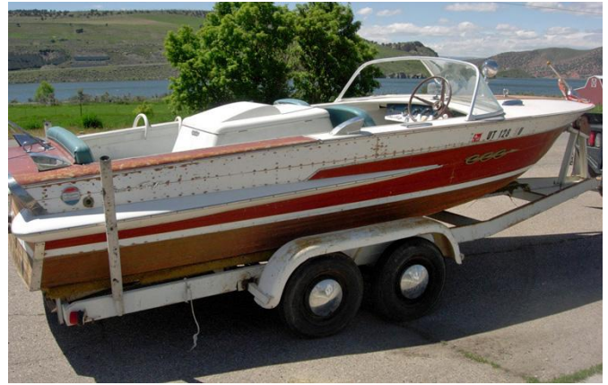
1964 CHRIS CRAFT SUPER SPORT 20'