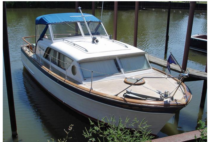
1961 CHRIS CRAFT CONSTELLATION 28'