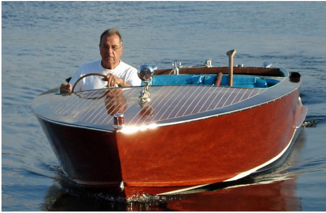
1964 DUNPHY X-55 17'

BARN FULL OF BOATS. Owner says, "Still have several boats for sale. Here are the items: ** 1958 St Lawrence River Launch, Hutchinson design, built by Adams, 23 feet, Mahogany lapstrake. 100 HP Chris Craft engine with 1 1/2 to 1 reduction gear. Boat needs minor restoration. $3500. ** Rhodes Banton sailboat, trailer, two sets of sail, needs cosmetic work. only $1000. ** 1938 Skaneateles Lightning sailboat, # 755. 1st class condition, new deck cover, single bottom, two sets of sails. Allan Boat Company trailer, $3500. ** Cayuga Boat Company Lightning sailboat, aluminum mast, trailer, needs new deck covering and paint and varnish, $1500 ($1000 with wooden mast) sails ** I also have a 1964 Dunphy X-55 , 17 ft, 215 HP Interceptor engine, completely rebuilt, original upholstery and floor covering, mahogany decks, galvanized trailer, perfect condition. $12,500... The engine has only been run aprox 10 min since the rebuild. It was overbored, new pistons, rings, crank turned, all new bearings." Orchard Park, NY (Buffalo area). Contact Mick at 716-662-1949 or MickG16@aol.com