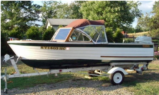
1962 CRUISERS INC. SEAFARER 17'