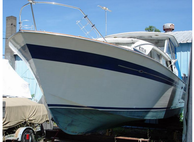
1963 CHRIS CRAFT CONSTELLATION 30'

Subscription Rate: $19.95 for one year (4 issues). Subscribers can list boats for FREE in Bone Yard Boats!