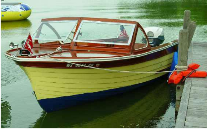
1962 THOMPSON SEA LANCER

1962 THOMPSON SEA LANCER. Owner says, " '63 75hp Evinrude on Karavan trailer with brakes. Restoration completed in 2002. Kirby "Lemonade" yellow (orig) over Navy blue and stained with Interlux Chris Craft #573 (red) stain. Pettit Captains varnish, well coated and completely revarnished 9/08. Paint refreshed 9/08. Completely rewired and fused. Engine starts easily and runs well. Custom seats with new aft bench seat 9/08 just in front of engine. Seats 6-7. Stored indoors. Home port Pewaukee, WI. " Asking $8,500. Contact Cliff at 262-370-5492