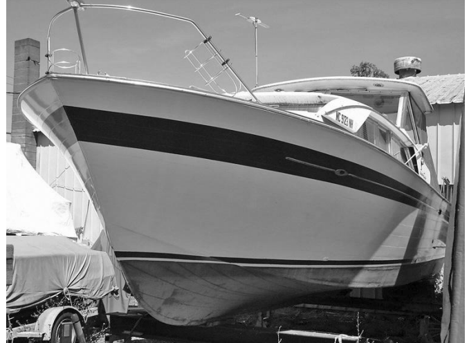
1963 CHRIS CRAFT CONSTELLATION 30'

Subscription Rate: $19.95 for one year (4 issues). Subscribers can list boats for FREE in Bone Yard Boats!