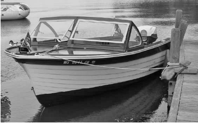
1962 THOMPSON SEA LANCER

1962 THOMPSON SEA LANCER. Owner says, " '63 75hp Evinrude on Karavan trailer with brakes. Restoration completed in 2002. Kirby "Lemonade" yellow (orig) over Navy blue and stained with Interlux Chris Craft #573 (red) stain. Pettit Captains varnish, well coated and completely revarnished 9/08. Paint refreshed 9/08. Completely rewired and fused. Engine starts easily and runs well. Custom seats with new aft bench seat 9/08 just in front of engine. Seats 6-7. Stored indoors. Home port Pewaukee, WI. " Asking $8,500. Contact Cliff at 262-370-5492