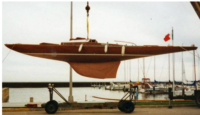
22 SQUARE METER -- ARETE

to the location of any square meter boat that is in need of rescue, is in storage, or best yet that is actively being sailed, to the following email address for inclusion into the square meter registry: info@squareskerryachts.net