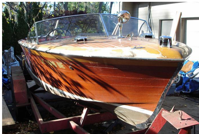
1951 CHRIS CRAFT HOLIDAY 19'

1951 CHRIS CRAFT HOLIDAY 19'. "Vintage 1951 Holiday, top of the line and one of the most stylish models of the CC line up. This model had blond covering boards that extended into the first plank, a raked bow, raked and curved transom, and a teak strip floor. This is a nice original boat that needs refinishing. Has a couple of cracked planks that may be repairable; always advisable to do a bottom job, although optional. Has all hardware except stern pole. Engine is a KLC 120hp that probably needs rebuilding. Comes with trailer." Asking $6200. North Metro Detroit. Contact Maury at 248-693-2256 or mjdebell@comcast.net (MI)