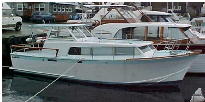
1965 TOLLYCRAFT EXPLORER 32' – details on page 11.