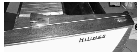
1959 HI-LINER OUTBOARD 16'

1959 HI-LINER OUTBOARD 16'. "Restored spring of 07. Deck replaced, solid mahogany. Mahogany ply hull. Solid mahogany floors. All wood repaired with West System, 14 coats of epiphanes varnish. All wood restored. All original chrome in good condition. Missing outboard, windshield, needs seat cushions. Original trailer in good condition." Asking $5500. Email RAYJAY1902@aol.com (CT)