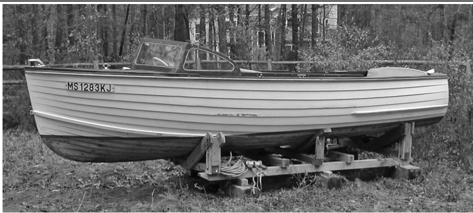
1956 CENTURY VIKING 19' WITH GRAYMARINE MODEL 620 INBOARD

1956 CENTURY VIKING 19'. Owner says, "A classic wooden motorboat. Great project. Completely restored in mid-1990's. Structurally sound, engine in good shape, but needs work to bring back to mint condition." Asking $5000. Call Leita at 617-868-8811 or luchetti@bu.edu (MA)