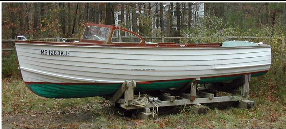
1956 CENTURY VIKING 19' WITH GRAYMARINE MODEL 620 INBOARD

1956 CENTURY VIKING 19'. Owner says, "A classic wooden motorboat. Great project. Completely restored in mid-1990's. Structurally sound, engine in good shape, but needs work to bring back to mint condition." Asking $5000. Call Leita at 617-868-8811 or luchetti@bu.edu (MA)