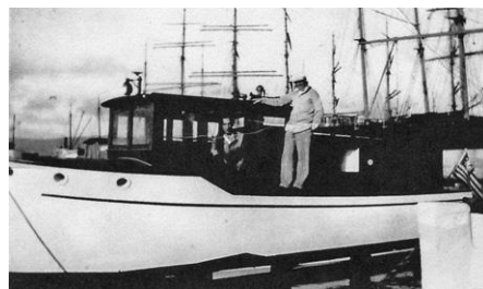
1930 CUSTOM BRIDGEDECK CRUISER 30'