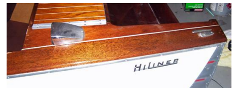
1959 HI-LINER OUTBOARD 16'

1959 HI-LINER OUTBOARD 16'. "Restored spring of 07. Deck replaced, solid mahogany. Mahogany ply hull. Solid mahogany floors. All wood repaired with West System, 14 coats of epiphanes varnish. All wood restored. All original chrome in good condition. Missing outboard, windshield, needs seat cushions. Original trailer in good condition." Asking $5500. Email RAYJAY1902@aol.com (CT)