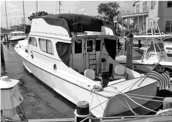
FREE - 1941 CARL ADAMS SPORTFISHER 43' - "Very solidly built."

"The Good: PROSPECTOR is in amazingly good condition for a vessel from 1941, but she is from 1941. She is floating fine on her lines, takes on relatively little water, and has been a warm home for the past 16 months or so. We keep a 110 sump in her bilges to keep her dry, but have left the sumps off for over 2 weeks with no concerns.