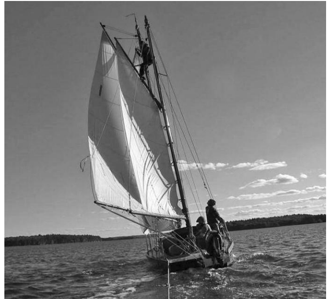
1939 SEA BIRD YAWL 27'

1939 SEA BIRD YAWL 27'. 8' beam and 4' draft. Home built from Thomas Flemming Day design - "sails beautifully, really fun and easy to handle." White pine and white oak with full white oak keel. 9.9hp Yamaha outboard.