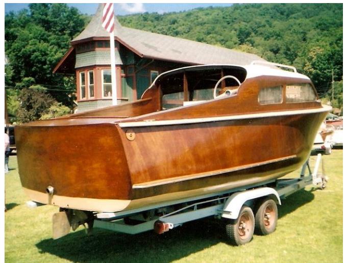
1955 U.S. MOLDED SHAPES CABIN CRUISER 20'

1955 U.S. MOLDED SHAPES CABIN CRUISER 20'. Molded hull and cabin. Powered by a Chris Craft 'K' 6 cylinder. Upgraded to 12 volt. Very nice condition. Includes double axle trailer. Owner says, "This is a unique boat with its molded plywood construction – very unusual in the 20' model and to be in such nice shape. Roomy enough to sleep two." Asking $9000, offers. Contact Dana at 585-289-8674. Upstate NY (14548)