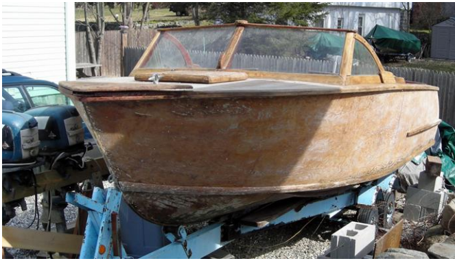
1956 TROJAN UTILITY 18'

1956 TROJAN UTILITY 18'. Owner says, "Original hull in very good condition. 18 foot LOA and 7 foot beam. Deck needs some carpentry and refinishing. Hull is stripped, bottom needs to be. Includes original hardware, a pair of 1956, 35HP Evinrude outboards and two-axle wood frame trailer. This is a great, simple restoration project that you can easily complete by summer." Contact Quentin at 860-857-2198 or email Quentin.snediker@mysticseaport.org . Asking $2250. Can be inspected in Mystic, CT. (In the photo above, the two Evinrudes can be seen to the left of the bow on a stand.)