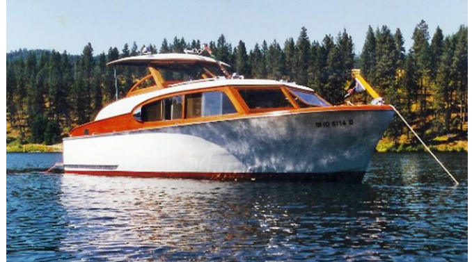
1956 CHRIS CRAFT SEDAN CRUISER 27'

bright work as well. Boat also has the hard top on it and canvas for the rear area that needs to be replaced. I don't think the motors have ever been out of the boat. I do have a spare motor that I acquired just in case that will go with the purchase. It is a little older motor but last I checked it spins free. The boat is on Lake Coeur d'Alene, Idaho and has been for sixteen great seasons. Very original, runs well. I really love this boat but life changes! I no longer have the time. It will be tough to part with but if she goes to a good home that will be ok." Includes triple axle galvanized trailer. Asking $10,000. Contact Chris at Roadhog57@comcast.net . Spokane, WA