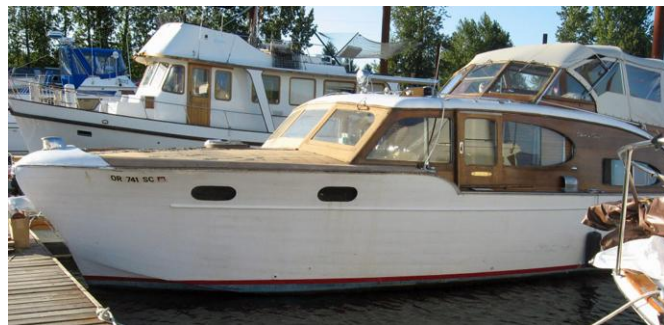
1954 CHRIS CRAFT CABIN CRUISER 40'

...had a caretaker/handyman stay aboard another 8 months, until last November. Since then, she's been moored under a covered slip at McCuddy's Marina in Portland, with the original intention of doing the work on her ourselves, and enjoy the delights of cruising the Columbia River. Ah, but plans and reality often collide, and become a different thing altogether. ...sadly, [we] realized the truth; we would not return to Oregon and Destiny, to live on the water again. I just wanted to let you know that Destiny is pretty "liveaboard" ready, for the right person(s) who would like to stay on her while working on her. According to the 2006 Survey, she had a tight hull with no leaks or rot. The damage is around the front and side windows, and front deck (which is now stripped off). We had a wonderful time while it lasted. I miss her badly!"