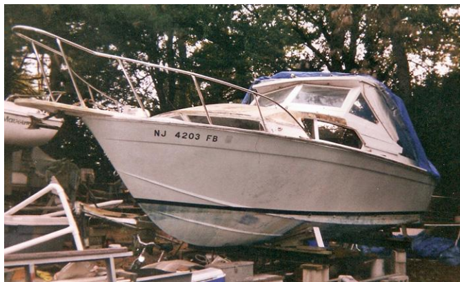
1970 CHRIS CRAFT CABIN CRUISER 26'

1970 CHRIS CRAFT CABIN CRUISER 26'. Owner says, "Boat is in good condition: fiberglass hull, wood upper, hardtop, standup head, dock power 110, sleeps 3 comfortably, 2 sinks, icebox, 10 x 10 cockpit, 350 rebuilt engine in boat not hooked up. Will sell motor separately. Needs minor woodwork and some paint. Make an offer! Shame to cut her up. Must go soon!" Call Dave 215-520-9505 / 215-745-7267 (PA)