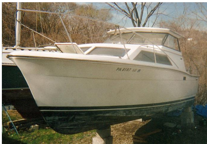
1976 TROJAN CABIN CRUISER 26'