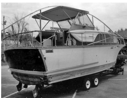
1964 OWENS 32' Twin V-8's, sleeps six. Needs Restoration.