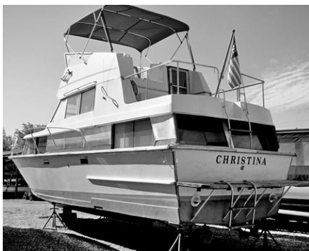
1972 BROADWATER 33' Twin 302 V8s; Sleeps 6; Aft cabin; Fiberglass cabin and fly bridge; bimini top; fiberglassed bottom; used yearly; good condition.