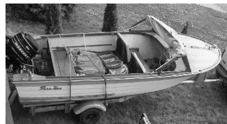
1961 PENN YAN LAPSTRAKE 16'