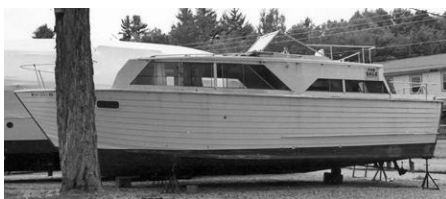
1966 CHRIS CRAFT CAVALIER 36' Boat needs restoration.