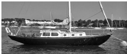
1963 PHILIP RHODES SWIFTSURE