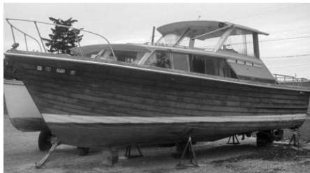
1963 CHRIS CRAFT CORINTHIAN 31'

Owner says, "TWIN 318's, that were winterized almost 2 winters ago, and were suppose to have been in great running order when stored. It is 100% original, and actually, pretty awesome. Yes, it needs some TLC, but everything is there. It is located in Sandusky Ohio, and all is owed is $72 a month storage since Jan 1, 2009. So, through Sept., it's $648. I have good and clear title in hand."