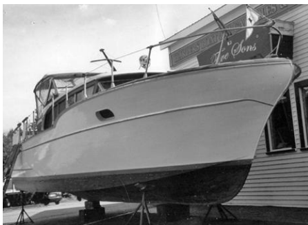
1959 CHRIS CRAFT CONSTELLATION 36' Twin 6 cylinders. Needs total restoration.

According to the owner, the four boats featured below fall within the typical Bone Yard Boats price cap of $10K. Some are significantly under, so if you see a boat that interests you, contact Jerry in Meredith, NH at 603-279-8841 or harperboats@gmail.com.