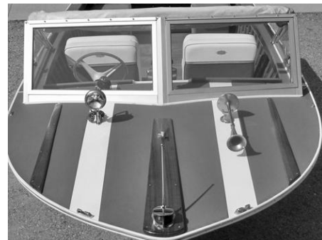
1964 THOMPSON THOMBOY 18'

1964 THOMPSON THOMBOY 18'. Hull is Fir marine plywood over oak. 7' beam. Owner says, "This boat has been in the family since 1965, has original seats and instrumentation;