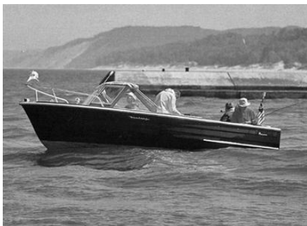
1963 CENTURY RAVEN 19'

1963 CENTURY RAVEN 19'. Needs restoration. Asking $4,500.