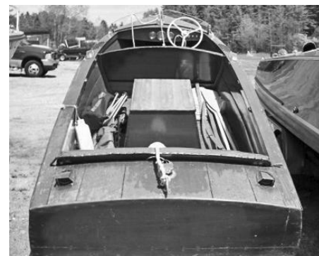
1940 CHRIS CRAFT UTILITY 16'