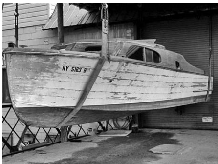
1948 CHRIS CRAFT EXPRESS CRUISER 23'

1948 CHRIS CRAFT EXPRESS CRUISER 23'. Hull #1281. SAMARI LADY has a 6 cyl. Chrysler and is complete. Needs total restoration. Asking $3500.