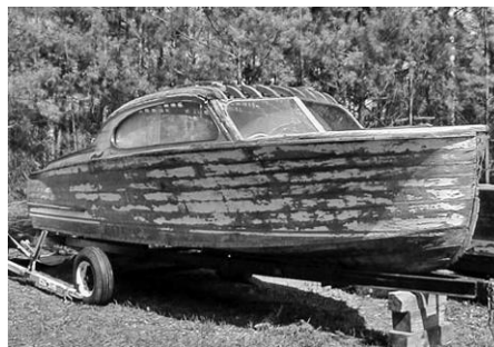
1947 CHRIS CRAFT HARDTOP 22' Needs restoration. Asking $5,500.