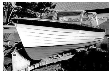
1957 LYMAN 22'

V-8 Just rebuilt, needs decks, rest in great shape. Asking $6,500