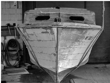
SAMARI LADY – 1948 CC EXPRESS 23'

The boats on Page 6 & column 1 of Page 7 are being offered for sale by Spencer Boatworks of Saranac Lake, NY. If you are interested in any of their boats, please call (518) 891-5828 or restore@antiqueandclassicboats.com