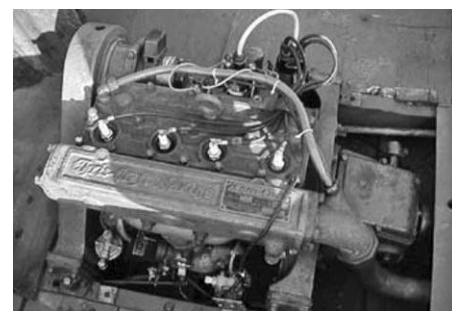
1940 CHRIS CRAFT UTILITY 16'