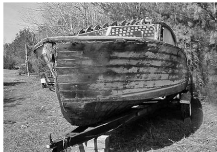
1947 CHRIS CRAFT HARDTOP 22'

16' CHRIS CRAFT (Year not specified) Needs total restoration. Asking $2,500.