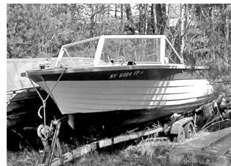
1964 GRADY WHITE 20'

V-8 inboard. Fun day boat. Asking $6,500.