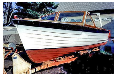
1957 LYMAN 22'

V-8 Just rebuilt, needs decks, rest in great shape. Asking $6,500