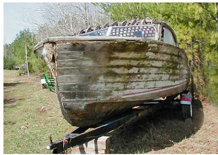
1947 CHRIS CRAFT HARDTOP 22'

16' CHRIS CRAFT (Year not specified) Needs total restoration. Asking $2,500.