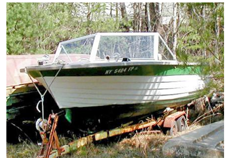
1964 GRADY WHITE 20'

V-8 inboard. Fun day boat. Asking $6,500.