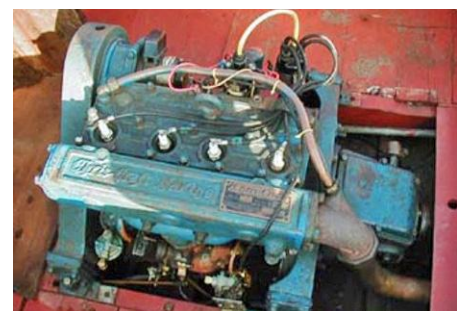
1940 CHRIS CRAFT UTILITY 16'