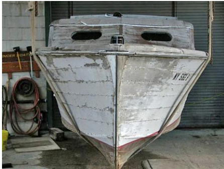
SAMARI LADY – 1948 CC EXPRESS 23'

The boats on Page 6 & column 1 of Page 7 are being offered for sale by Spencer Boatworks of Saranac Lake, NY. If you are interested in any of their boats, please call (518) 891-5828 or restore@antiqueandclassicboats.com