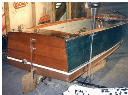
1931 DODGE UTILITY 19'

Needs total restoration. Asking $3,500. (Note the Dalmatian in the foreground, left.)