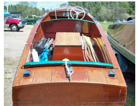
1940 CHRIS CRAFT UTILITY 16'