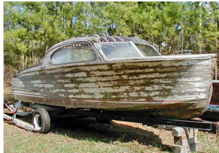
1947 CHRIS CRAFT HARDTOP 22' Needs restoration. Asking $5,500.