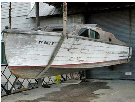
1948 CHRIS CRAFT EXPRESS CRUISER 23'

1948 CHRIS CRAFT EXPRESS CRUISER 23'. Hull #1281. SAMARI LADY has a 6 cyl. Chrysler and is complete. Needs total restoration. Asking $3500.