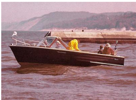
1963 CENTURY RAVEN 19'

1963 CENTURY RAVEN 19'. Needs restoration. Asking $4,500.