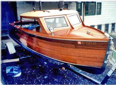
1938 GARWOOD CABIN UTILITY 20' Hardtop, needs restoration. Asking $8,500.