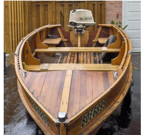
1952 GIESLER CEDAR STRIP 16'