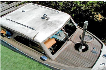
1949 CHRIS CRAFT EXPRESS 26' SEMI-ENCLOSED CRUISER