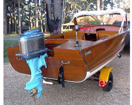
1957 WHIRLWIND 16'

was restored by Tim Digennaro from California, Maryland (Solomon Islands), a respected Merc master mechanic in antique boat circles. It's as new as it can get with three test hours on it. Fresh water engine! It was painted in two tone mercury blue, which is an original factory color. Draws a crowd!