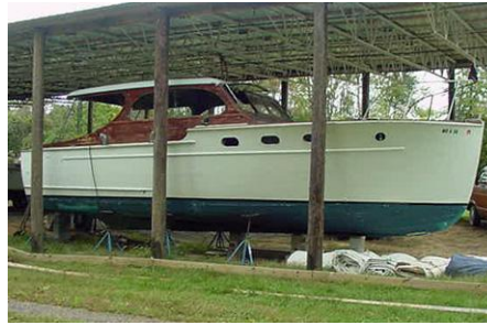
1940 CHRIS CRAFT SPORT CRUISER 33'

repair. Beautiful curves make every view of this boat pleasing to the eye. Most finishes are original and aged. The canvas on the top is still good. The canvas on the foredeck has been removed. The original script [Chris Craft logo] is in the drawers along with trim and engine parts. There is no rot at the deck step or anywhere else. The original stern has amateur repairs around the exhaust pipes.