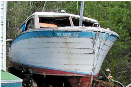
1949 CHRIS CRAFT EXPRESS 26'