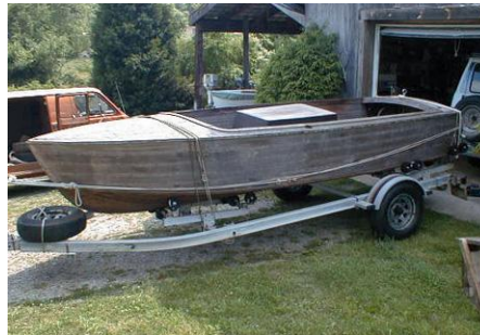
1952 CHRIS CRAFT UTILITY 17'

1952 CHRIS CRAFT UTILITY 17'. Owner says, "The bottom has been gone over and is in nice shape. The inner bottom is the original plywood, in good shape as well. All underwater hardware is included. This boat comes with a nice trailer that is in good condition. Utility hull provides for much enjoyable times on the water because of the space. The decks are weathered and in need of repair. The dash is split, some seats and floorboards are missing. Everything has been thoroughly cleaned and is ready for sanding. Gas tank is good and now set in place." Asking $3000. Call Howard at 301-627-2114 or oldtimeworld@aol.com (MD)